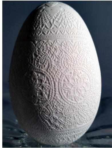
21 Classic • Goose Etched Mia Sohn, "It's a Nice Day for a White Wedding"