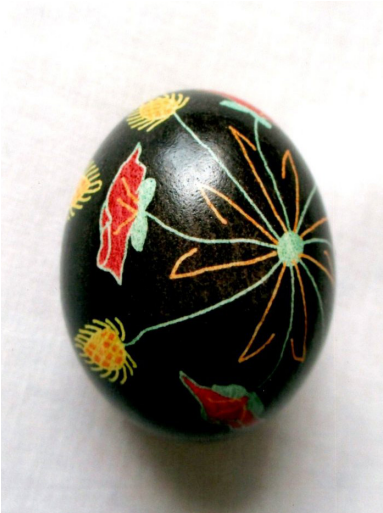
08 Classic • Chicken Wax-resist, poppies, rye & wheat on black (symbolizes soil) Stefania Hac