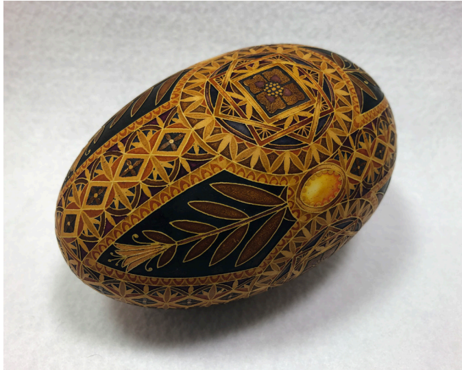
39 Championship • Rhea Wax-resist, etched, made to resemble carved wood Theresa Somerset