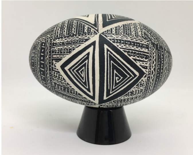
41 Championship • Goose Wax-resist Colours and patterns influenced by Eastern European, African and Native Arts Christina Yurchyk