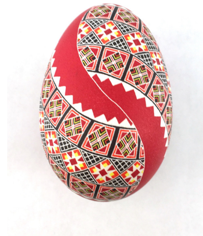
23 Classic • Goose Wax-resist Shannon Wallis