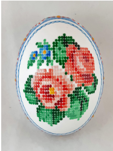
10 Classic • Duck Raised wax Karen Hanlon