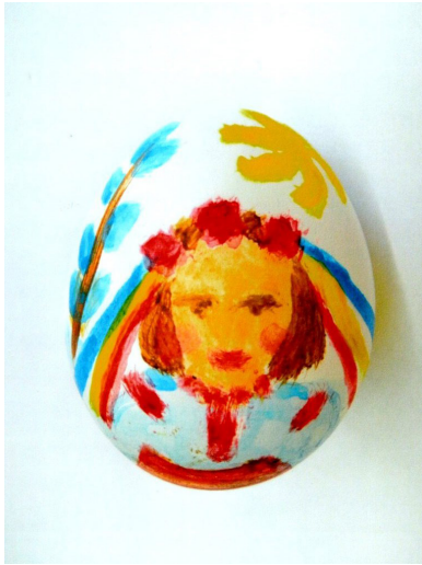
04 Classic • Chicken Mixed media Ludmila Barmina, "Spring"