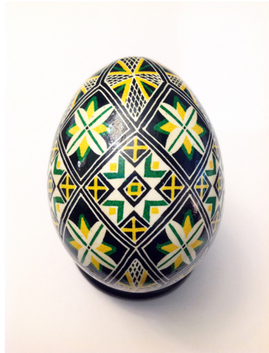
17 Classic • Chicken Wax-resist Hanya Kohut