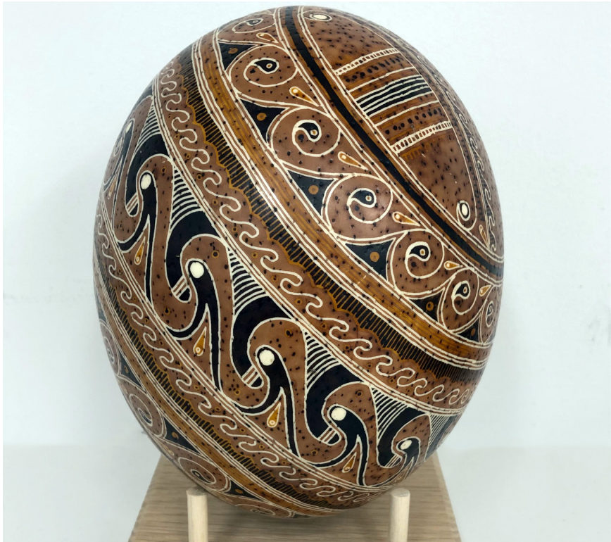
43 Ostrich Wax-resist Daena Diduck, "Trypilian"