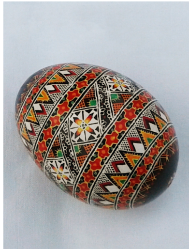
07 Classic • Chicken Wax-resist Nadia Gennings