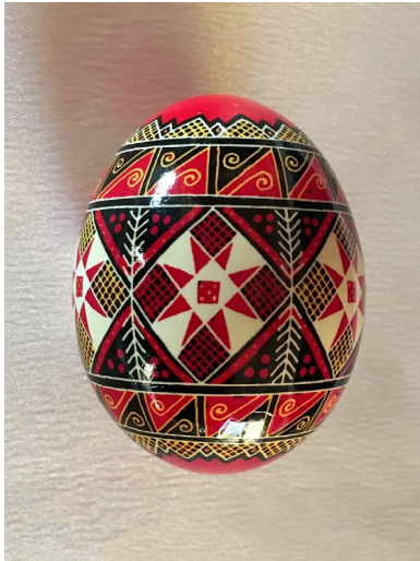
06 Classic • Chicken Wax-resist Kelly Evans