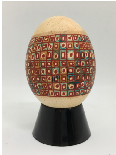
24 Classic - Chicken Wax-resist, wash, bleach Colours and patterns influenced by Eastern European, African and Native Arts Christina Yurchyk