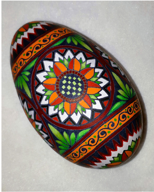
30 Championship • Large Turkey Wax-resist, wash, etched Natalie Kit