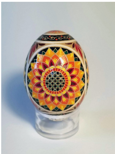
14 Classic • Chicken Wax-resist, acid-etched, washed Natalie Kit