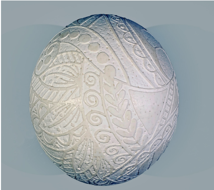
46 Ostrich Etched Cassandra Wysochanskyj