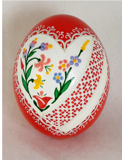
09 Classic • Chicken Raised wax Karen Hanlon