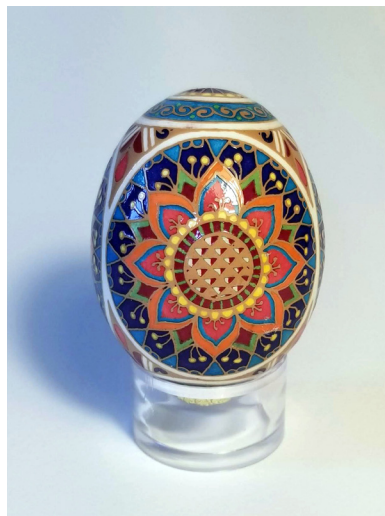
15 Classic • Chicken Wax-resist, acid-etched, washed Natalie Kit