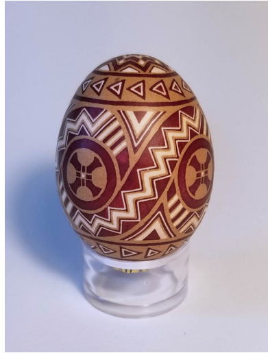
13 Classic • Chicken Wax-resist, acid-etched Trypillian fusion style egg on a brown shell Natalie Kit