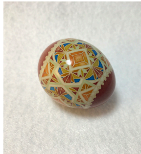
03 Miniature • Ring neck pheasant Wax-resist, acid-etched Theresa Somerset