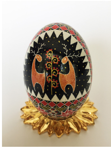
05 Classic • Chicken Wax-resist Tracy Criscitiello