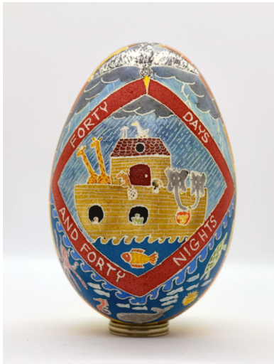
18 Classic • Goose Wax-resist Alice Sharp