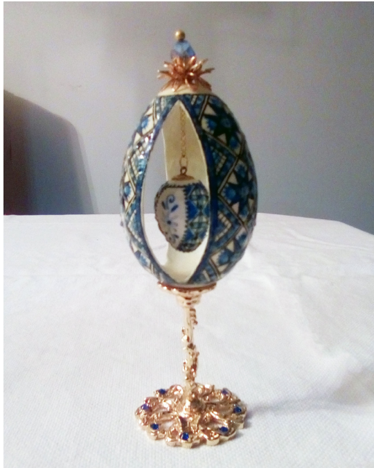
25 Championship • Goose & Quail Raised wax, carved, jewelled Quail egg suspended in carved goose egg Stephania Blahut