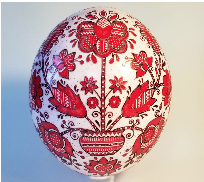
44 Ostrich Wax-resist, etched, based on rushnyk (embroidered cloth) motifs from Poltava, Ukraine Natalie Kit