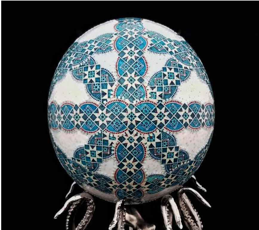
42 Ostrich Wax-resist, etched Jordan Byrd