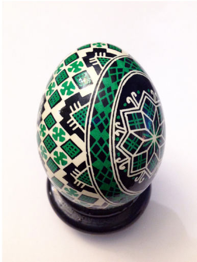
16 Classic • Chicken Wax-resist Hanya Kohut