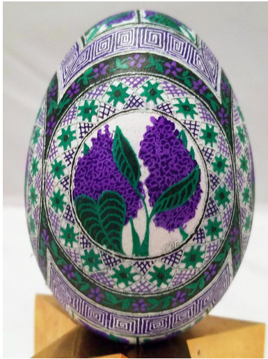
20 Classic • Goose Wax-resist, etched Mia Sohn, "Lilac Festival"