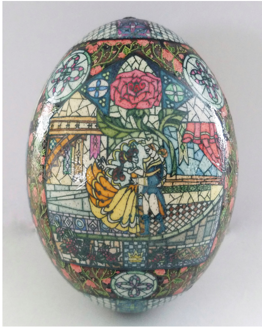
26 Championship • Rhea Wax-resist, etched, epoxy coated to resemble antique stained glass Jordan Byrd, "Beauty and the Beast"