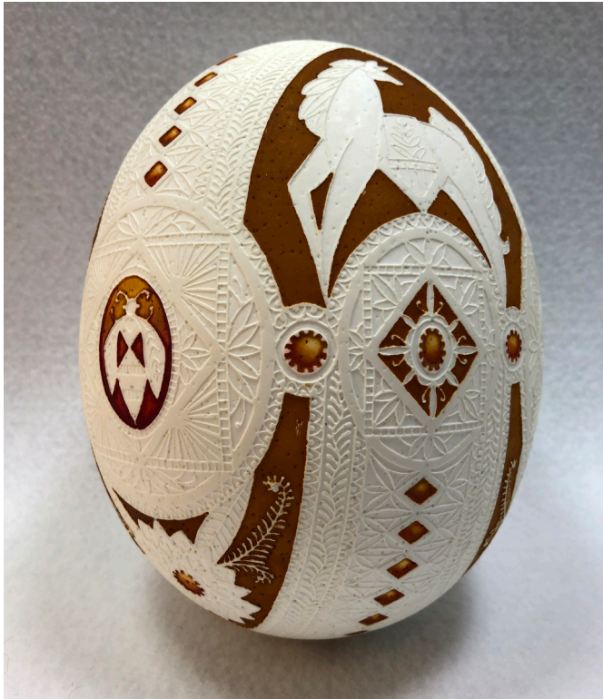
45 Ostrich Wax-resist, etched, resembling a carved shell Theresa Somerset