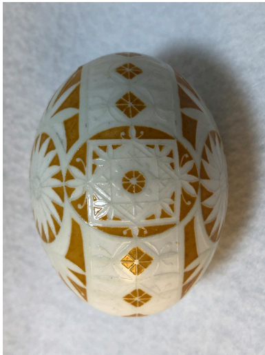
22 Classic • Duck (blue) Wax-resist, etched Written to resemble Wedgwood/Jasperware Theresa Somerset