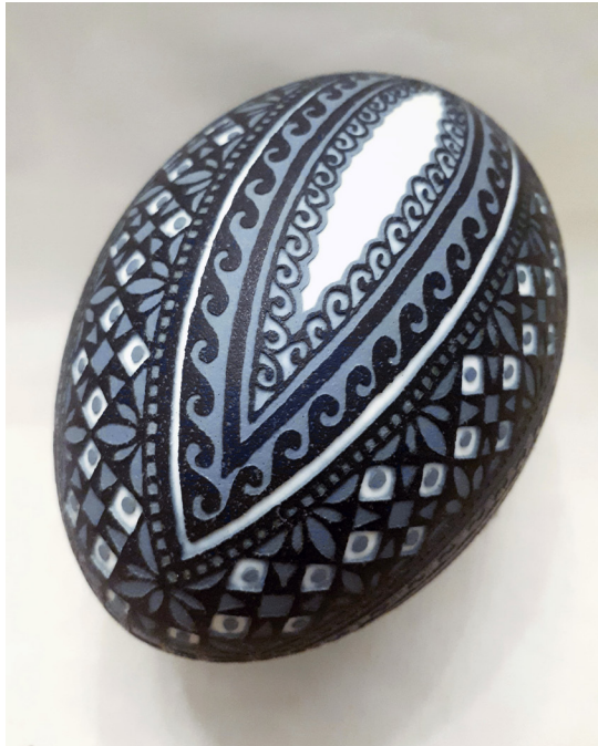
32 Championship • Emu Etched, natural shell colour Natalie Kit