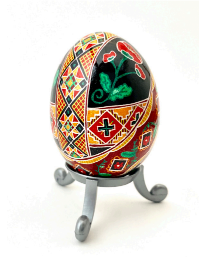
11 Classic • Chicken Wax-resist Kathleen Hataley