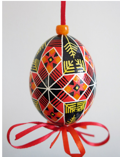
19 Classic • Chicken Wax-resist, acid-etched Anastasia Shved